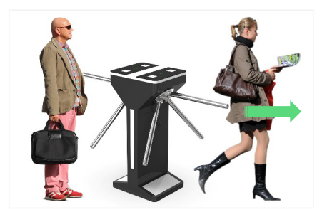
Only one person passes at a time