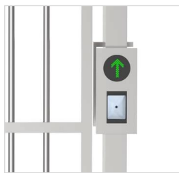
Barcode and QR reader