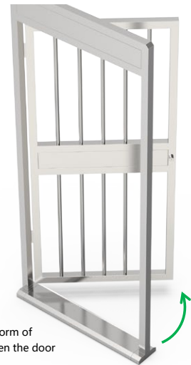
A form of open the door