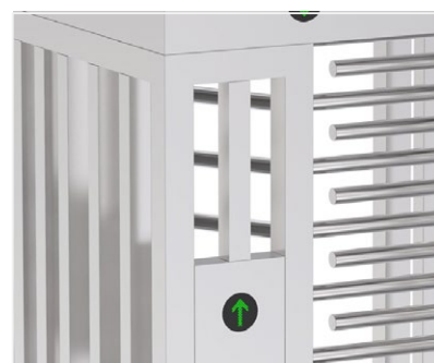
Stable steel structure 80*80 (mm)