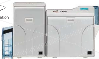
Estación de laminado