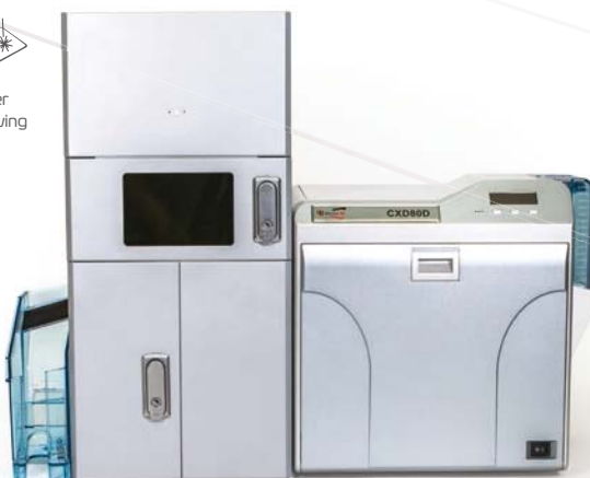
Laser engraving module